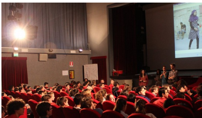
"Caro Campo" workshop for schools, San Casciano, April 2014