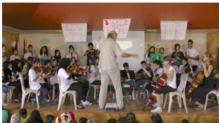
Community music workshop, Burj Al Shemali, August 2014