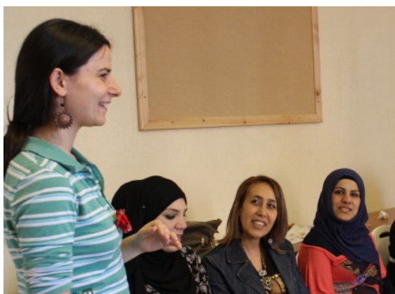
Community music training, Beddawi, April 2014