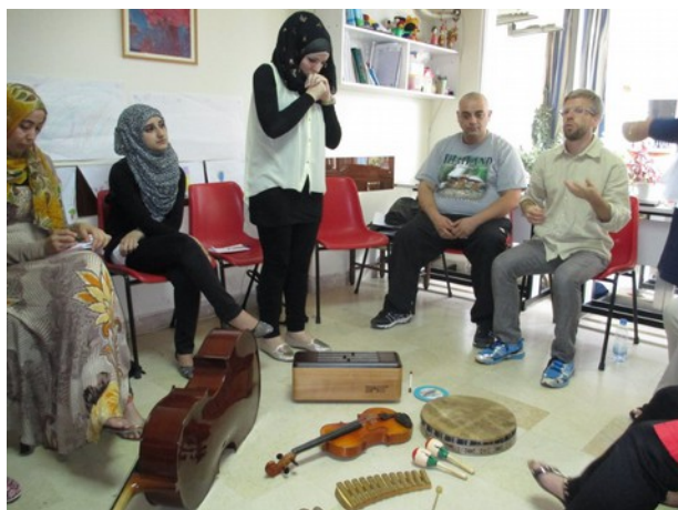
Music Therapy training, Beirut August 2014

www.primamateria.it / info@primamateria.it