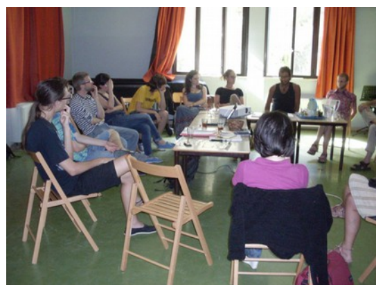
Orientation course, Montespertoli June 2014

www.primamateria.it / info@primamateria.it