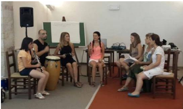
Music therapy workshop

In conclusion we would like to underline the success and importance of this first phase in reaching the objective of the qualification of the first 2 music therapists in Lebanon, to support our partner Assumoud in the development of music therapy resources for the refugee communities, Palestinian and of other nationalities, in Lebanon.